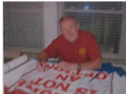
Kranz autographs a blanket for a wounded service member.