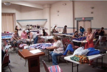
Angels and others working on blankets.

"Soldiers' Angels sponsored a 'Blanket Making Day' on Sunday afternoon, July 13th from noon to 4 pm. It was hosted by the Women's Ministry at First Lutheran Church in Northridge, CA and held in their large, air-conditioned 'Natterstad Hall.' Forty-one people from a variety of places came together to make over 30 blankets. There were Angels, people from two churches, and some who had heard about the day at recent events where SA had hosted a booth. A local Girl Scout troop had earned their Bronze badges by making Blankets of Belief and added their 22 blankets to the pile! Fifty completed blankets were delivered to the Newbury Park warehouse later that week. Quite a few more sets of fabric went home with participants and will be returned at the next 'Blanket Making Day' which will be scheduled in the near future."