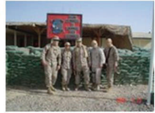
"Sand Scarves at Work"

It's hot, hot, hot in Iraq and Afghanistan. We know that the troops appreciate the cooling ties and sand-protection scarves we send. Don't miss out... be a part of this relief effort! For instructions on making Sand Scarves and Cool Ties, please visit www.soldiersangels.org , then under "Teams and Programs" click on "Scarves."