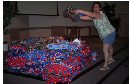
Adding the 50th Blanket to the pile!